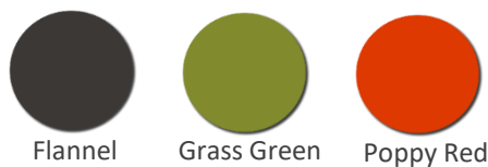
Flannel Grass Green Poppy Red