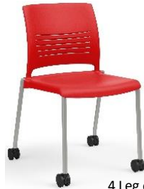
4 Leg on Castors