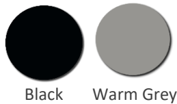
Black Warm Grey