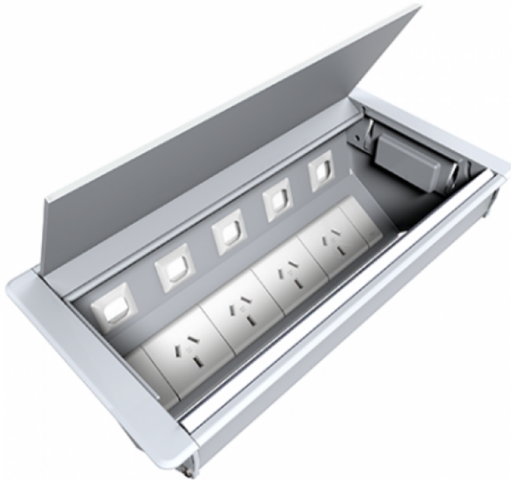
TABLE SURFACE MOUNTED SERVICE BOX - 4GPO+5DATA4 X AUTO SWITCHED GPO AND PROVISIONS FOR 5 DATA310MM W X 154MM D X 115MM H

Table Surface Mounted Service Box - 4GPO+5DATA 4 x Auto Switched GPO And Provisions For 5 Data 310mm W x 154mm D x 115mm H