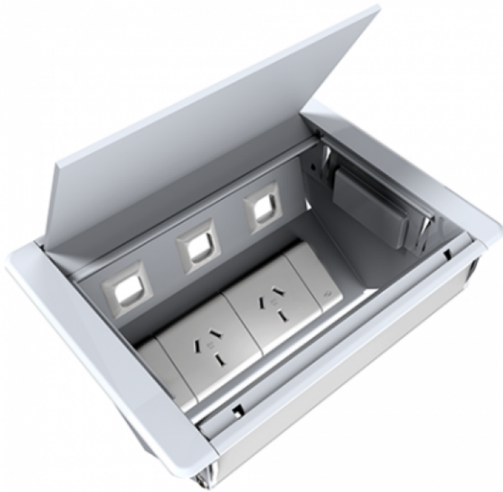
TABLE SURFACE MOUNTED SERVICE BOX - 2GPO+3DATA 2 X AUTO SWITCHED GPO AND PROVISIONS FOR 3 DATA 211.5MM W X 154MM D X 115MM H

Table Surface Mounted Service Box - 2GPO+3DATA 2 x Auto Switched GPO And Provisions For 3 Data 211.5mm W x 154mm D x 115mm H